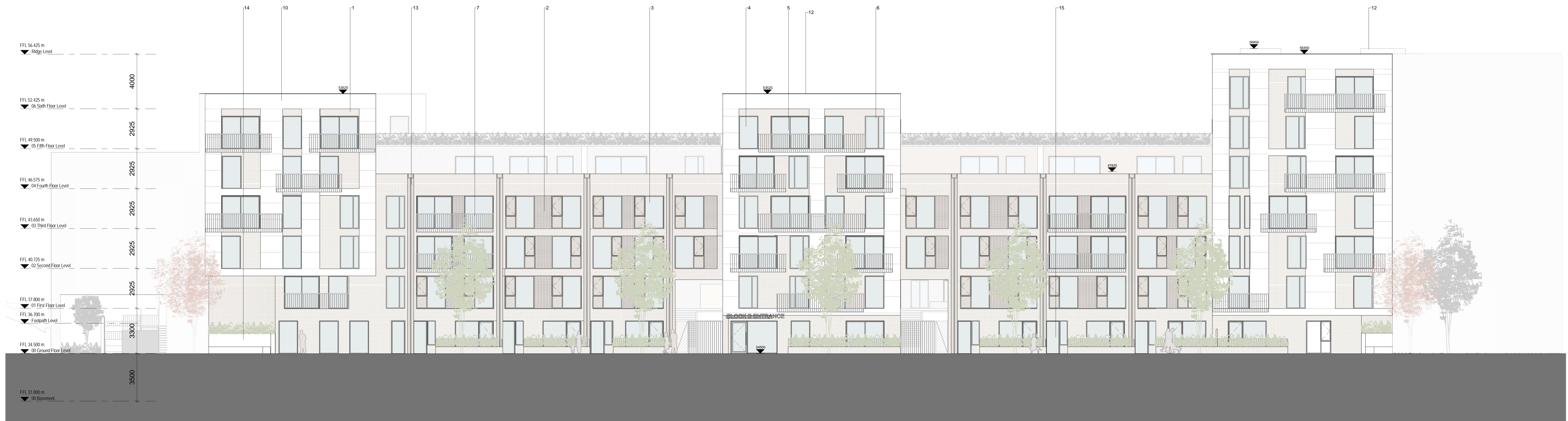
1 Elevation SE 1 : 100